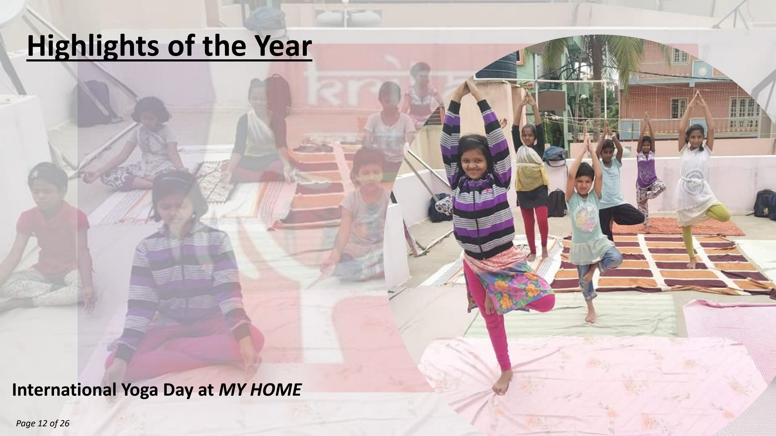
International Yoga Day at MY HOME