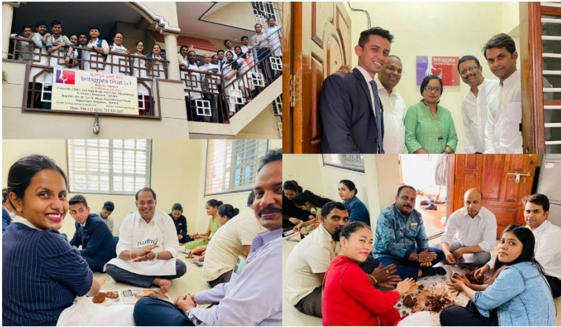
SEED BALL MAKING AT KRITAGYATA TRUST paathya