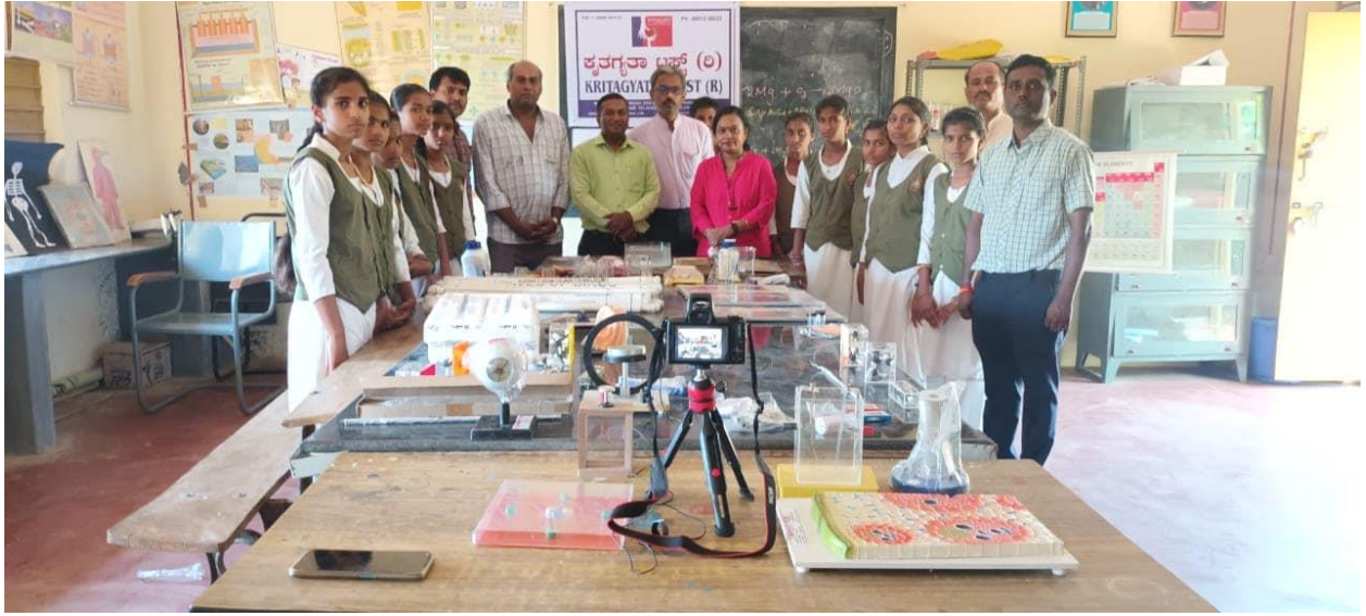
ಗೂ ನಗದು. ರೂ ೨೮,೧೦೦ ಮುಖ್ಯನಿಗೂಲೂಬ ಕುಲದವರೂ. ಮತ್ತು ಬಲ್ಲ ಕೆ.ಜಿ ನಿಶೋಟನ್ಸ್ ಮತ್ತು ಮಟ್ಟದ ವರದಿಗಾರರು ಉಪಸ್ಥಿತರಿದ್ದರು.